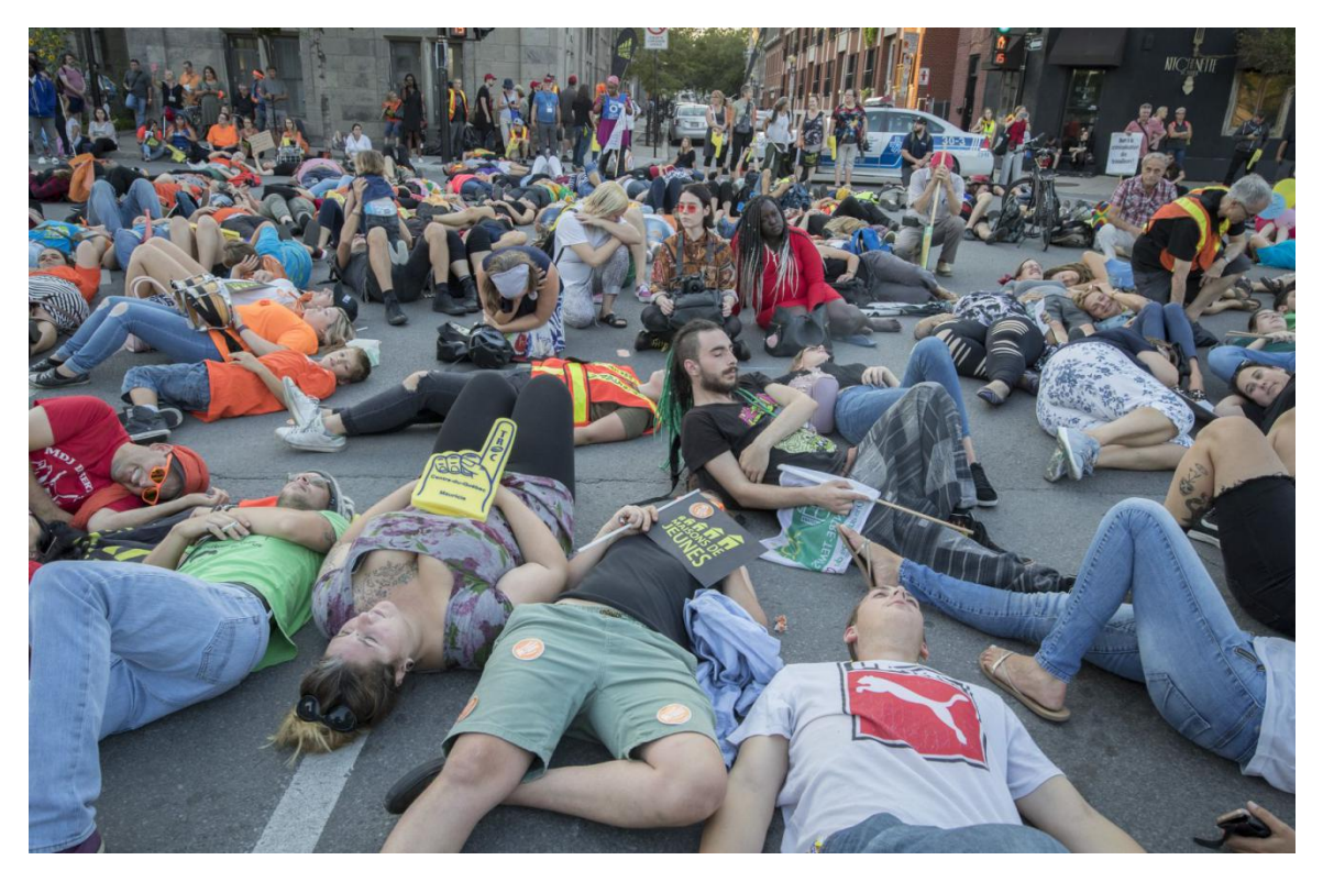
Greenpeace's orchestrated die-in in front of the CBC office